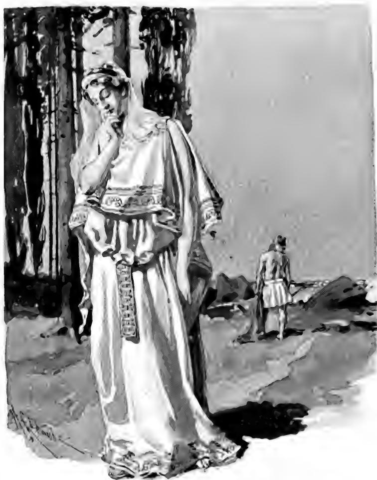
“CALYPSO, GORIBO'S GODDESS, SOUGHT HER HOME.—Page 280